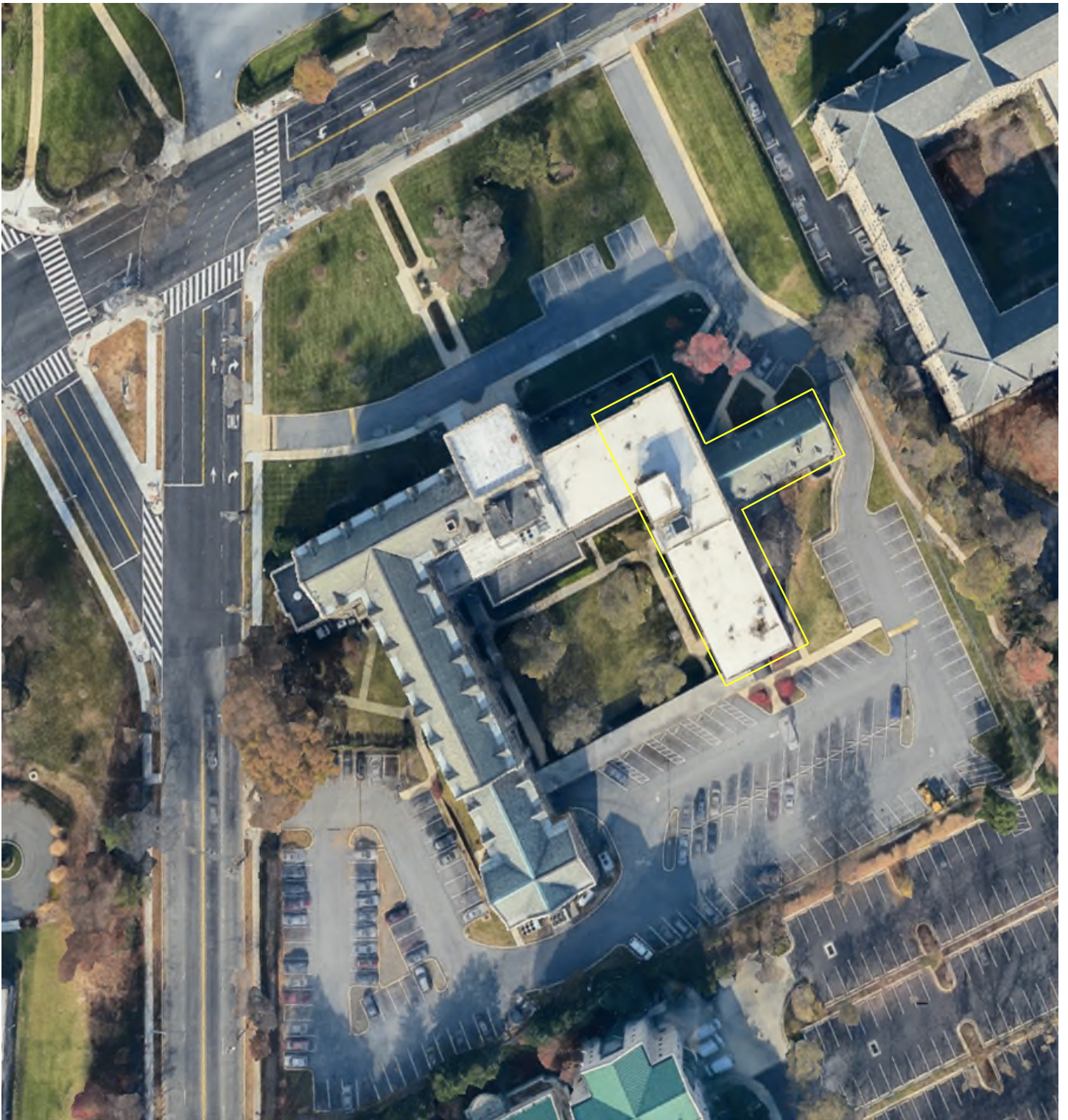
The use variance request in BZA Case No. 20844 is for 415 Michigan Ave, NE which is approximately shown in the area outlined in yellow on the image above.